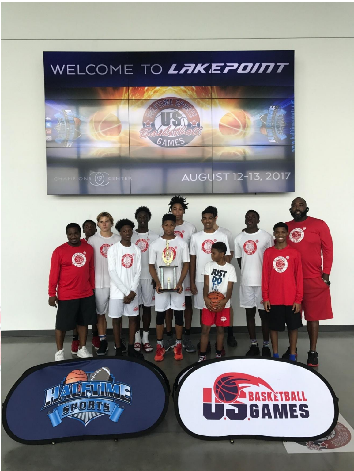
Scottie Barnes, Florida State, and current NBA player